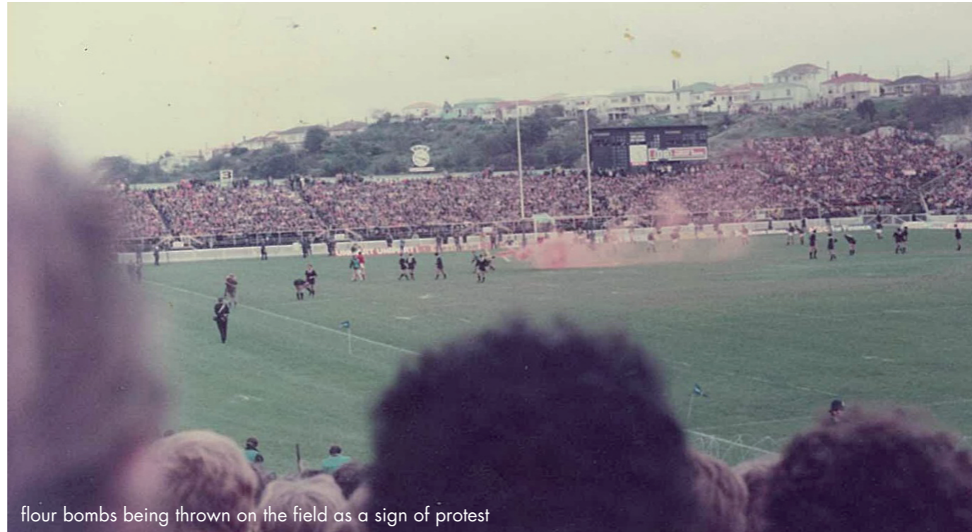
flour bombs being thrown on the field as a sign of protest

As in every country, there were critics on the current government, in South Africa, especially by the disadvantaged Black population. Characteristic for false democracies and autocracies is, that critics were forbidden